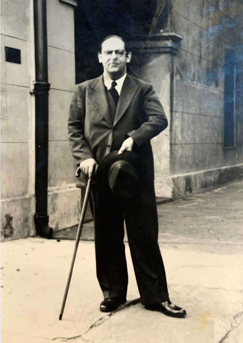
The photo mentioned opposite: IB stands on the corner of Chartres St (in the sun) and Pirate's Alley (in the shade) with the Cabildo state museum behind him