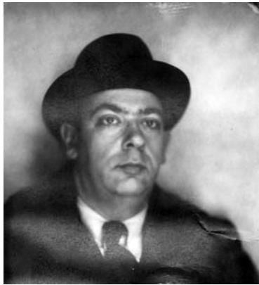
Possibly the photo referred to

I enclose a somewhat crudely executed snapshot of me by a very bad street photographer outside the St. Louis Cathedral of New Orleans (which I leave to-morrow). 232 It will, I am afraid, convey none of the blooming health which I am enjoying, nor the high spirits which this town cannot fail to induce in anyone. It is the only genuine Latin city in the Northern half of the Western Hemisphere (Quebec is bogus). The cafés are cafés, the faces & the intonation French, the old bistro types lounge about in complete unself-consciousness side by side with vigorous Anglo-Saxons from the North who are stimulating the shipbuilding & trade with Latin American – the Vieux Carré is gentle, provincial, full of gossipy old ladies in café gardens, old Frenchmen with beards & bréloques 233 etc. etc. I return to Wash on 2 d .